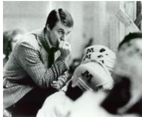
Herb Brooks at Minnesota